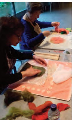
Felt making workshop