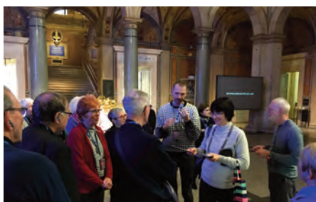
the group at the Austrian Museum of Applied Arts (MAK)