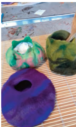
Felt making workshop