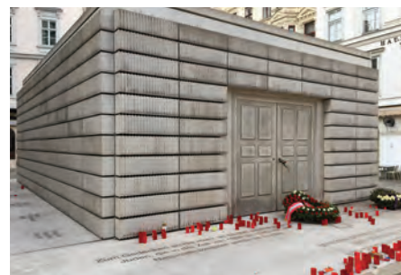
the Judenplatz Holocaust Memorial