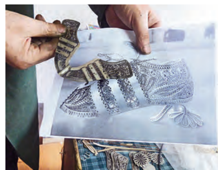
A silver filigree shoe for Adidas

'I am inspired by the working methods embroiderers and quiltmakers use and have used and I am proud to be part of this long tradition.'