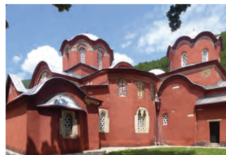
Monastery of the Patriarchate of Peć