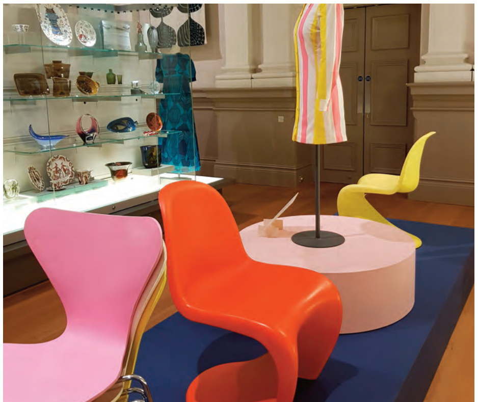
Nordic exhibition at Manchester Art Gallery

Some works, particularly textiles and wallpaper from the Whitworth are still on show at Manchester Art Gallery in the diverse and fascinating Nordic Craft and Design exhibition which showcases furniture, fashion, lighting, ceramics, glass, metalwork and jewellery. Don't miss it!