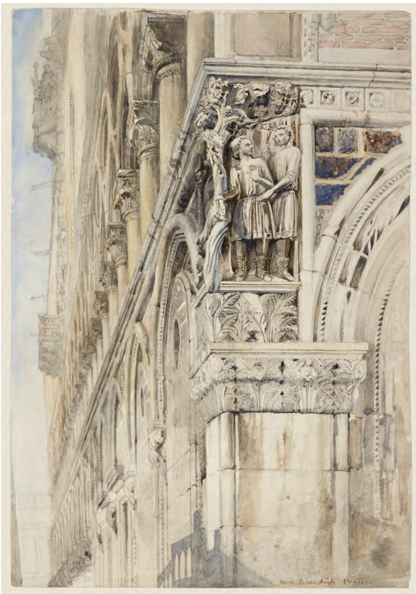
"Facade of The Doge's Palace, Venice - The Vine Angle", John Ruskin © Manchester Art Gallery / Bridgeman Images.