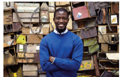
Ibrahim Mahama

Manchester International Festival is back in town this summer with events at the Whitworth. Animals of Manchester is in the gallery and the park 20/21 July - it pictures what life might be like if dogs, hogs, cats, bats and other creatures lived alongside us, not just as our pets, but as our peers. Quite a weekend!